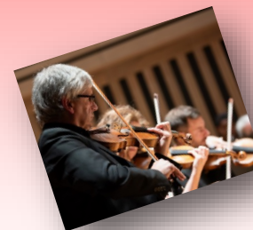
Northern Chamber Orchestra Solloist String Quartet