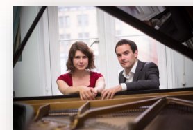
Willshire Piano Duo