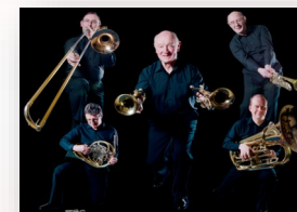
Prince Bishops Brass