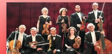
Kammer Philharmonie Europa